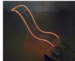
QCH-HEATER (actual product)

The QCH-HEATER consists of a 3D-shaped quartz glass tube containing a high-purity carbon wire. It can be used in atmospheric conditions as well as in vacuum environments. Compared to metal heaters, the QCH-HEATER has superior features such as: